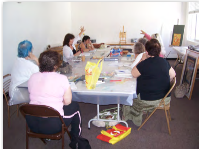
LA Experimental Artists work hard at preparing for the show: Improvizations IV.